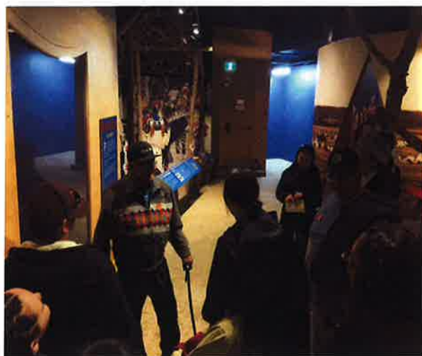
Satellite Campus Students