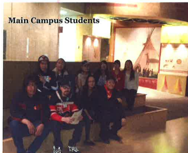
Main Campus Students