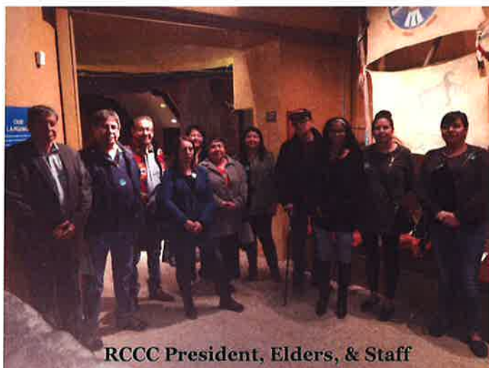
RCCC President, Elders, & Staff